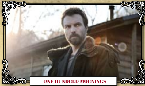
ONE HUNDRED MORNINGS

International Filmfest Emden-Norderney is the largest festival in its region and one of Germany's most highly-regarded, internationally recognised film festivals, screening on average over 100 films and attracting over 23,000 visitors each year. In 2010 it celebrated its Twenty-First Year.