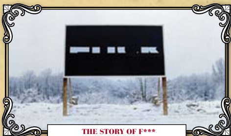
THE STORY OF F***