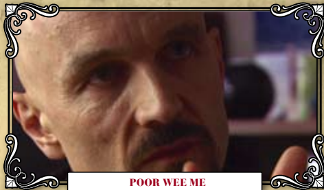
POOR WEE ME

Whether you're in search of the latest cinematic trends, a clearer understanding of the culture and history that produced them, or you just want to experience an entertaining selection of films, we've got it covered.