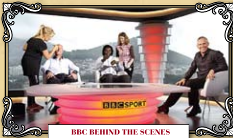
BBC BEHIND THE SCENES