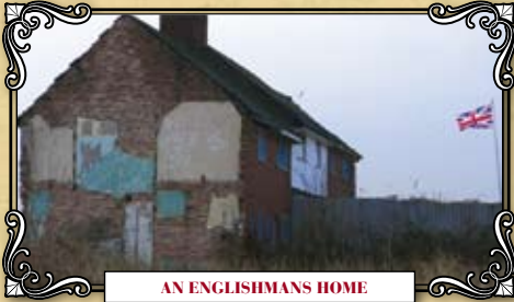
AN ENGLISHMAN'S HOME

"An Englishman's home is his castle and he has the right to defend it. And I don't give a toss about any judge, any court, no nothing. This is my castle and they better keep away!"